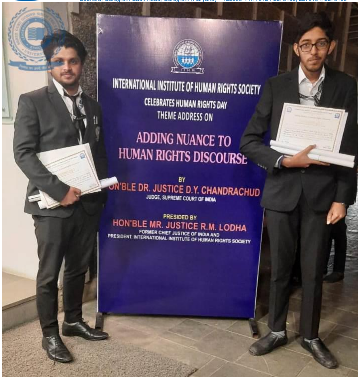
Figure:02 Students at the seminar venue

Budhera, Gurugram-Badli Road, Gurugram (Haryana) – 122505 Ph. : 0124-2278183, 2278184, 2278185